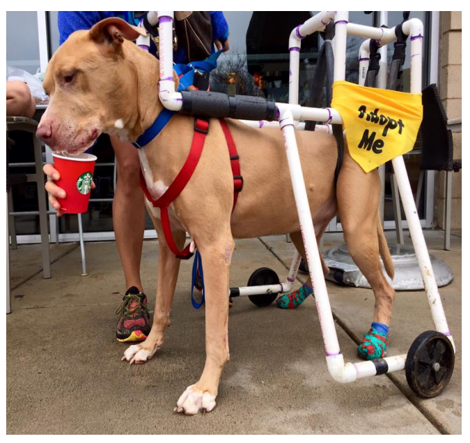
Figure 1: Volunteers knew that getting a 'puppachino' was French Fry's favorite way to end an outing

The shelter has several trained volunteers who assist with the Power Hour program. These volunteers arrive at the shelter before the power hours begin, assist in matching fosters with dogs, help fosters gather needed supplies, and check Power Hour fosters in and out via the shelter's software, saving the foster coordinator's time.