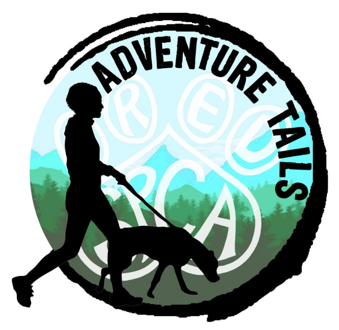
Check me out later!