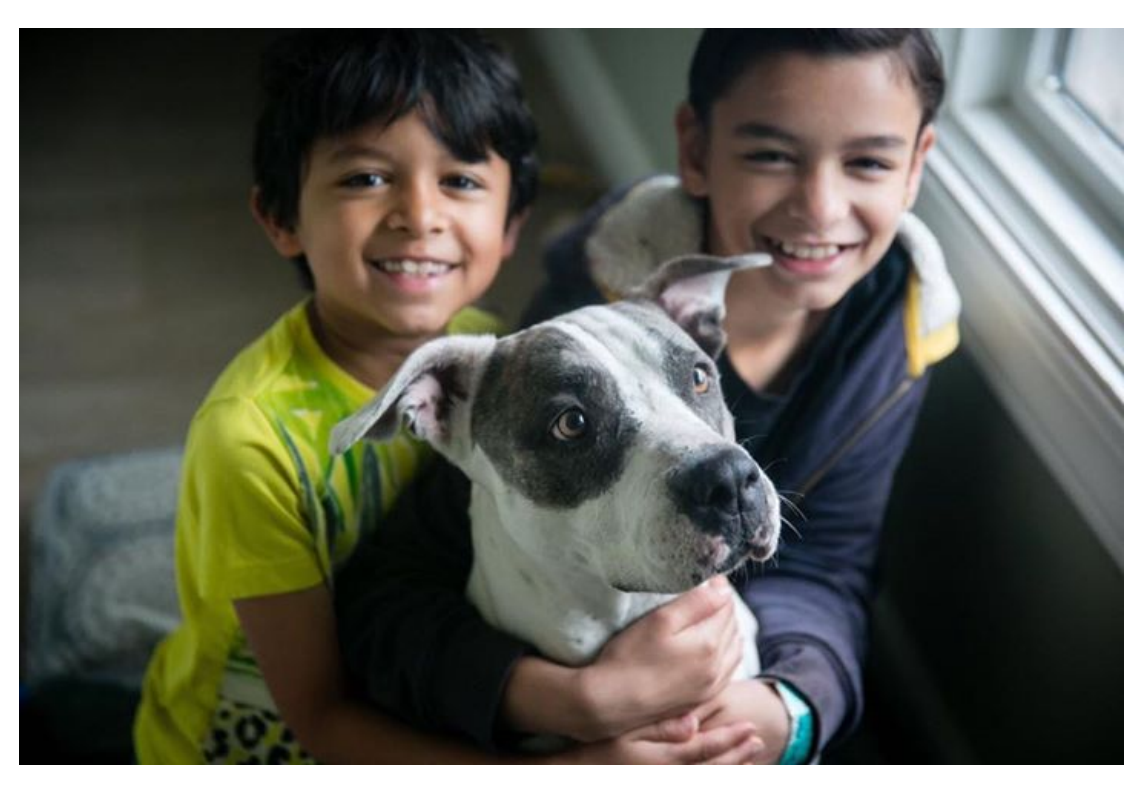
Weekend/Overnight Foster Care

Weekend and overnight foster care is a great way to get to know shelter dogs better, reduce kennel stress and find new ways to market them for adoption. Programs can be created based on the needs of your shelter.