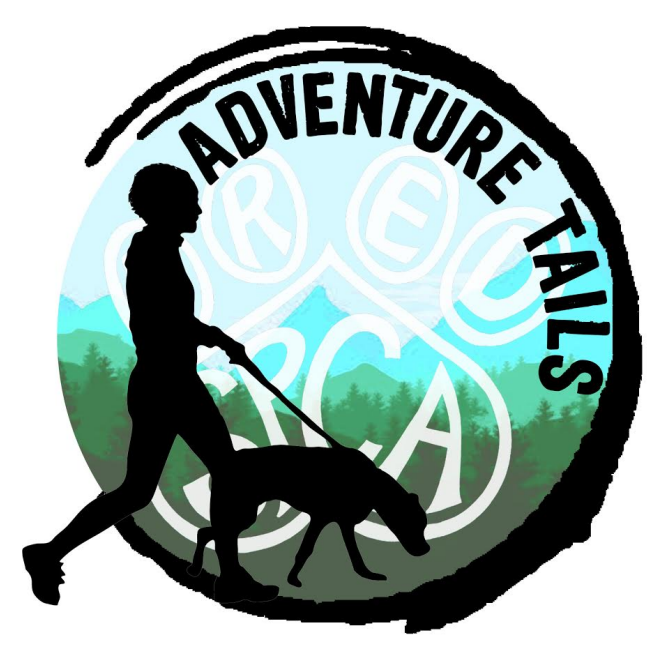
Check me out later!